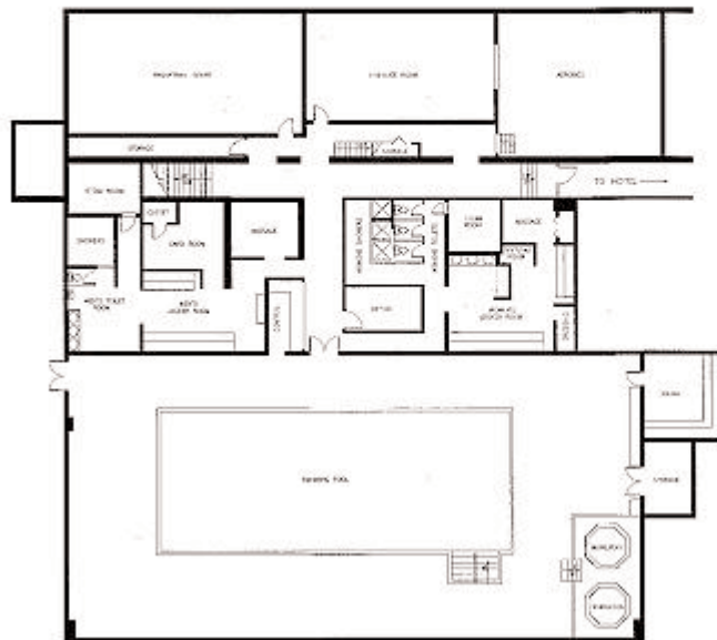
TARA HEALTH CLUB TARA HOTEL FRAMINGHAM, MA